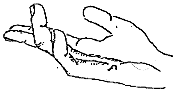
Dupuytren's Contracture affecting the ring and small fingers.

Over the years many splinting methods to straighten the fingers have been tried and are mostly unsuccessful without surgery. As surgery can never be curative (removing the disease completely), most patients will require a number of episodes of treatment during their lifetime.